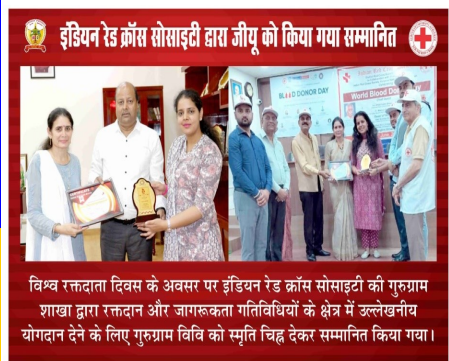
इंडियन रेड क्रॉस सोसाइटी द्वारा जीयू को किया गया सम्मानित

विश्व रक्तदाता दिवस के अवसर पर इंडियन रेड क्रॉस सोसाइटी की गुरुग्राम शाखा द्वारा रक्तदान और जागरूकता गतिविधियों के क्षेत्र में उत्कृष्टनीय योगदान देने के लिए गुरुग्राम विवि को स्मृति चिह्न देकर सम्मानित किया गया।