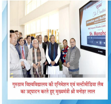
गुरुग्राम विश्वविद्यालय की एनिमेशन एवं मल्टीमीडिया लैब का उद्घाटन करते हुए मुख्यमंत्री श्री मनोहर लाल